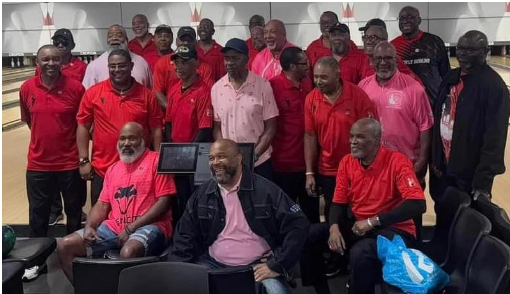
METROPOLITAN GENTS BOWLING CLUB