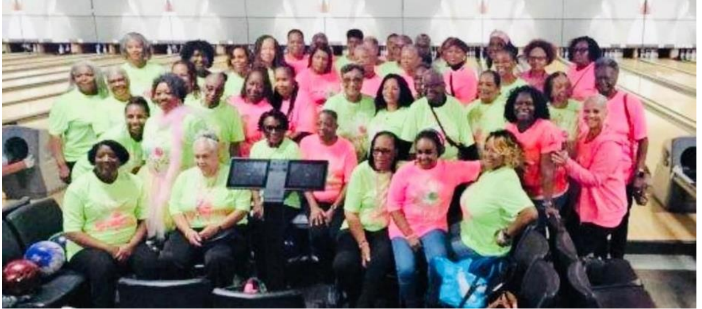
SASSY BUT CLASSY LADIES BOWLING CLUB