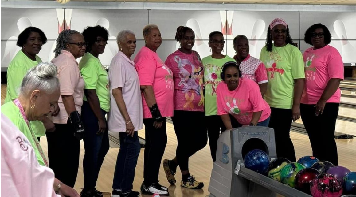
BREAST CANCER SURVIVORS